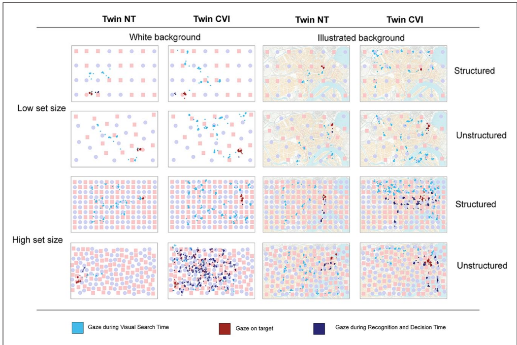
Figure 3. Superimposed gaze patterns of the twins on the eight different search displays with the varying task demands.

twin NT (VRT: 2.9 \pm 1.9 s versus 7.9 \pm 7.0 s and larger search areas ( 36 \pm 18\% versus 17 \pm 12\% ). Regarding VST and RDT, twin NT's visual search behaviour was efficient: On average, his VST was 2.0 \pm 1.6 s, and he verbally responded within a second ( 0.9 \pm 0.5 s). Twin CVI, however, needed more than twice as much time for VST ( 4.8 \pm 3.3 s) and more than three times as much time for DRT ( 3.1 \pm 6.4 s). This may imply that twin CVI had a much larger delay in giving a verbal response. Similarly, the search area of twin CVI was larger during VST, as well as during DRT (29% and 9%, respectively), than that of his brother (14% and 2%, respectively). In addition, twin CVI showed larger variability than his brother in practically all search parameters, indicated by the larger standard deviations (SDs).